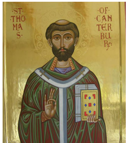
Byzantine style icon of St Thomas Becket

As we look forward to the coming year, may we all be steadfast in bearing fruits of the Spirit: love, joy, peace, patience, kindness, goodness, faithfulness, gentleness and self-control – that is a saintly list!