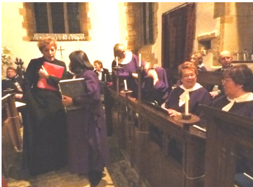
Christmas Choir Singers just before their fabulous performance.